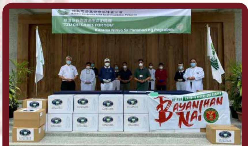
Published with permission

To the thousands of our big and small donors, our deepest gratitude. ~~UP-PGH Bayanihan Na! Operations Center