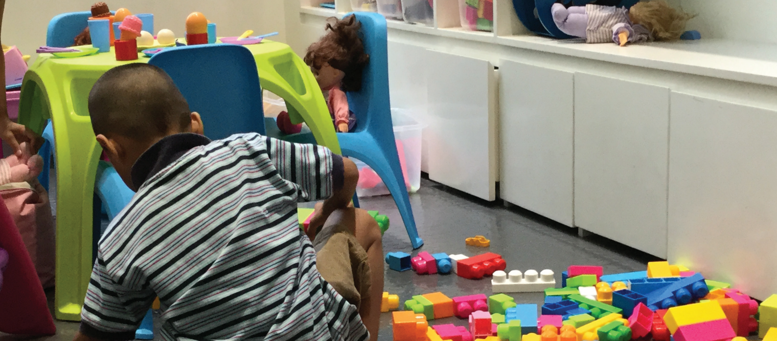
A child-patient in the playroom of the Child Protection Unit at the Philippine General Hospital