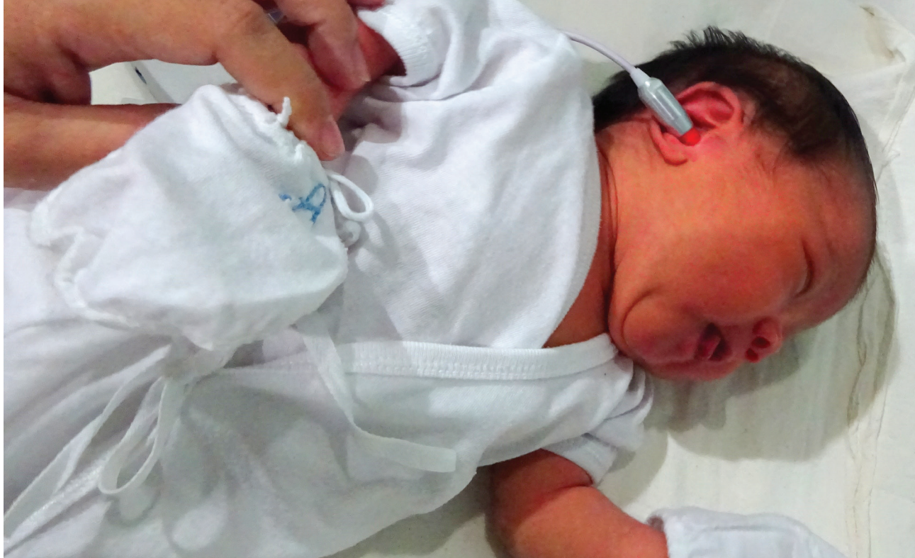
A newborn undergoing hearing screening