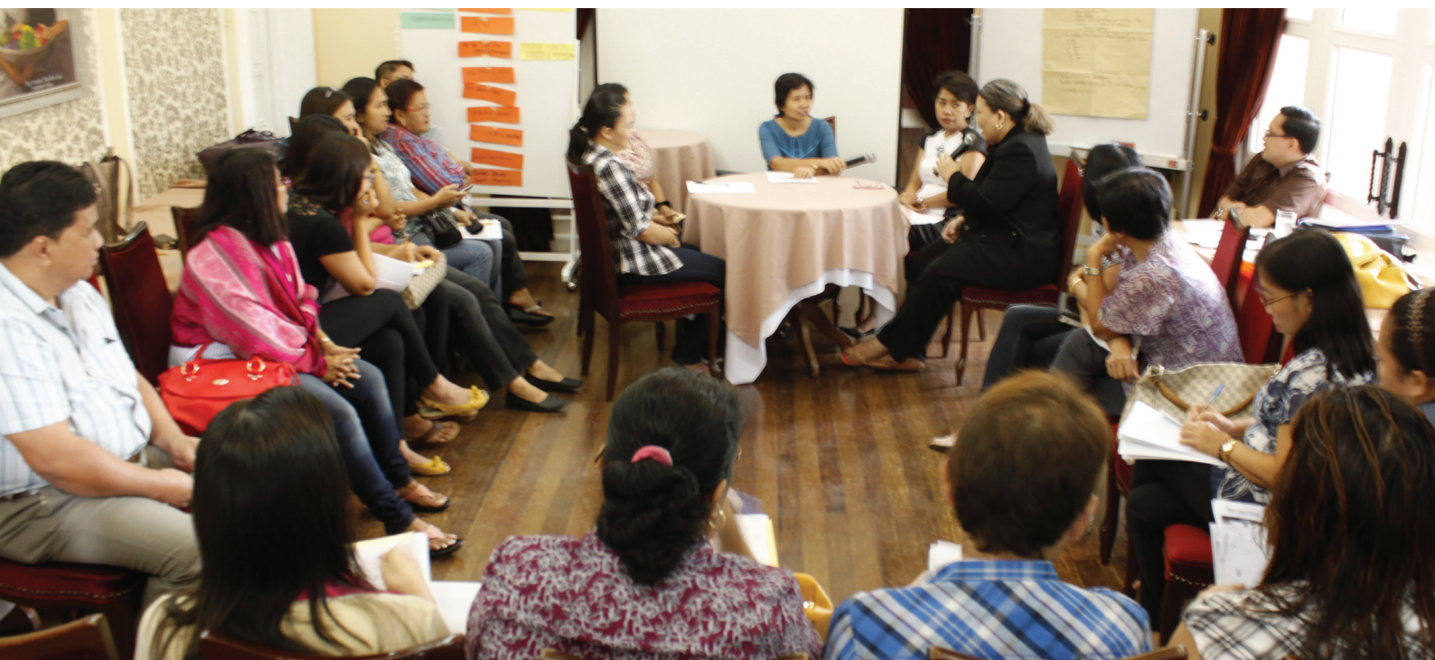
Multidisciplinary training in Baguio with PNP/NBI Manila participants