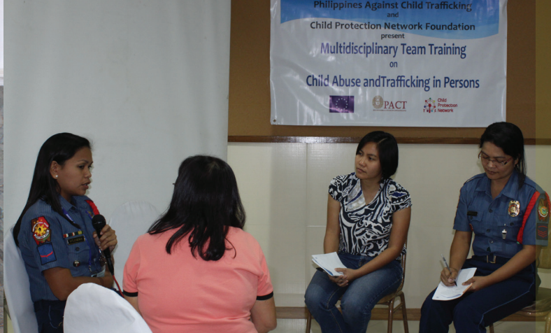
Multidisciplinary training in Baguio (left photo), Cagayan De Oro participants (right photo), Bukidnon participants

PGH CPU are focused on the prevention of child abuse.