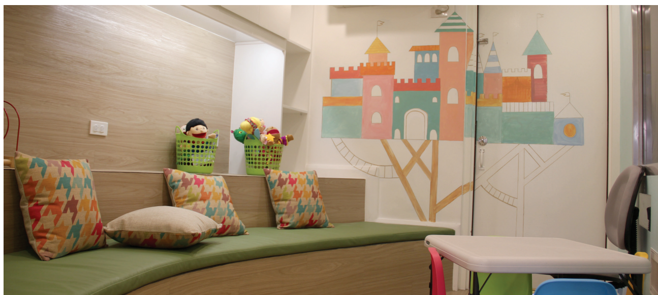
The PGH-CPU interview rooms

The PGH-CPU conducts parenting sessions for the parents of child abuse survivors. In six sessions of basic parenting class, the parents are expected to