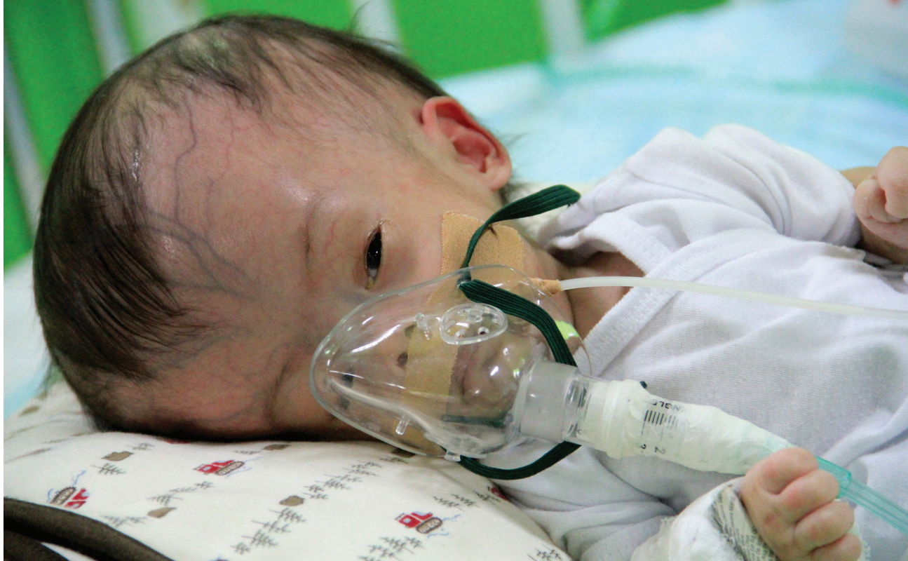
An infant confined in PGH with Hydrocephaly

for congenital disorders expedites early detection. This ensures that infants will be given the proper treatment and care, making some of the birth defects manageable and preventing them from becoming life threatening.