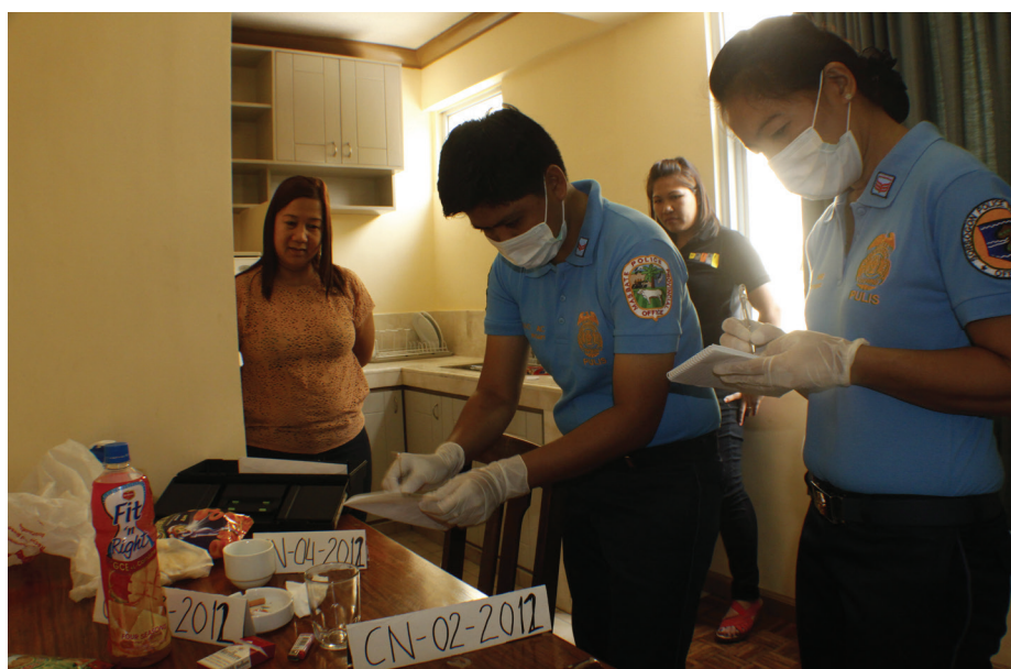
Women and Child Protection Desk (WCPD) police trainees conducting a crime scene investigation (CSI) on simulated cases of child abuse

The CPU also conducts a 'Kid's Court' where once a month, the children are given an opportunity to learn their rights before going to court for them to know and understand what they need to do while on the witness stand and what happens after they give their testimony in court. The children visit the actual courtroom, meet court personnel, as well as the presiding judge of a family court. This is to prepare for their court testimony, assist the family members on