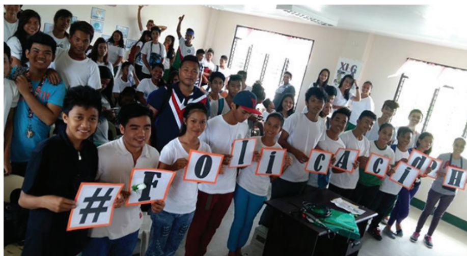
VYLH-Philippines Nampicuan (Nueva Ecija) conducted a lecture on the importance of folic acid among senior high school students.

5 The Philippine Birth Defects Surveillance Project (since 2008)