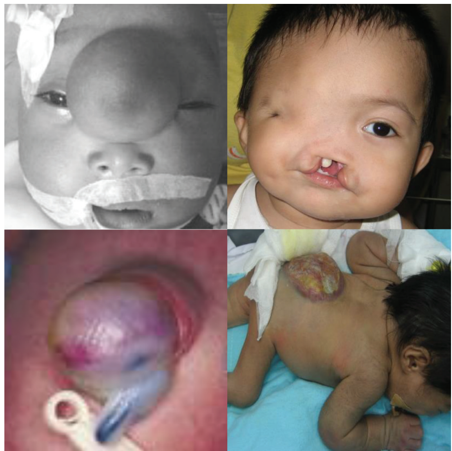
Children suffering from birth defects. (Top left) Encephalocoele; (Top right) Anophthalmos with cleft lip; (Bottom photos) Spina Bifida

Among the highlights of the proposed bill are: to ensure that every woman of reproductive age has