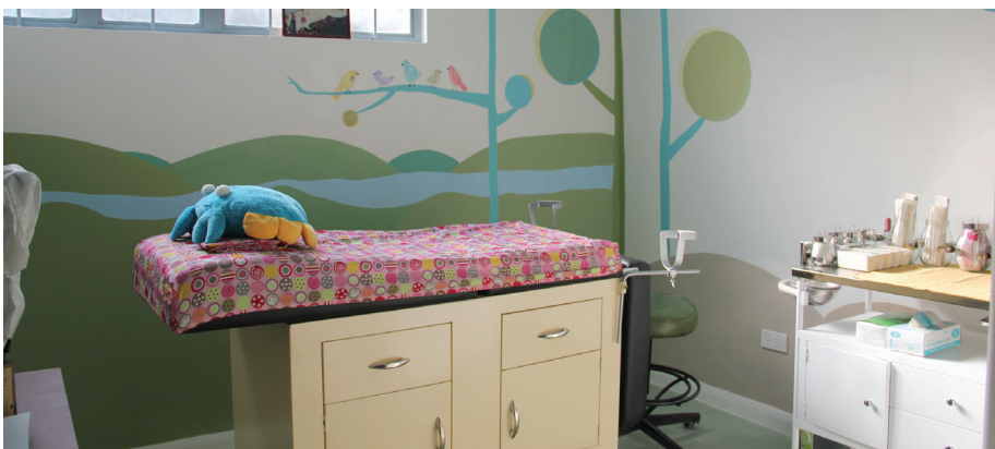
The PGH-CPU playroom

Forensic services have five components. The first is medico-legal evaluation , where the patients are jointly interviewed by the physician and social worker, followed by a comprehensive pediatric examination including genital and anal examination. The second is a videotaped forensic interview , where either a physician or a police officer performs the interview,