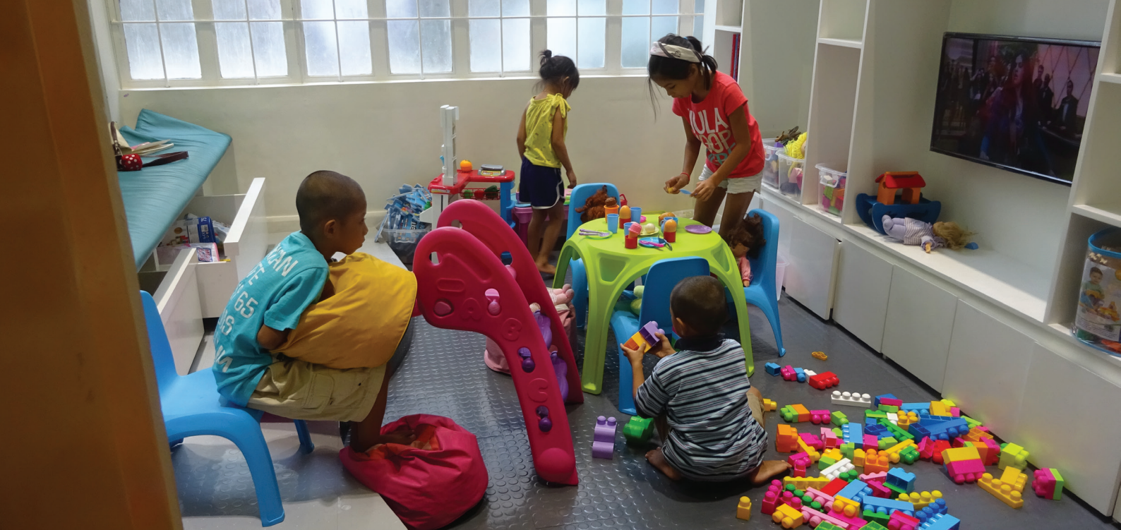
Children patients at the CPU playroom