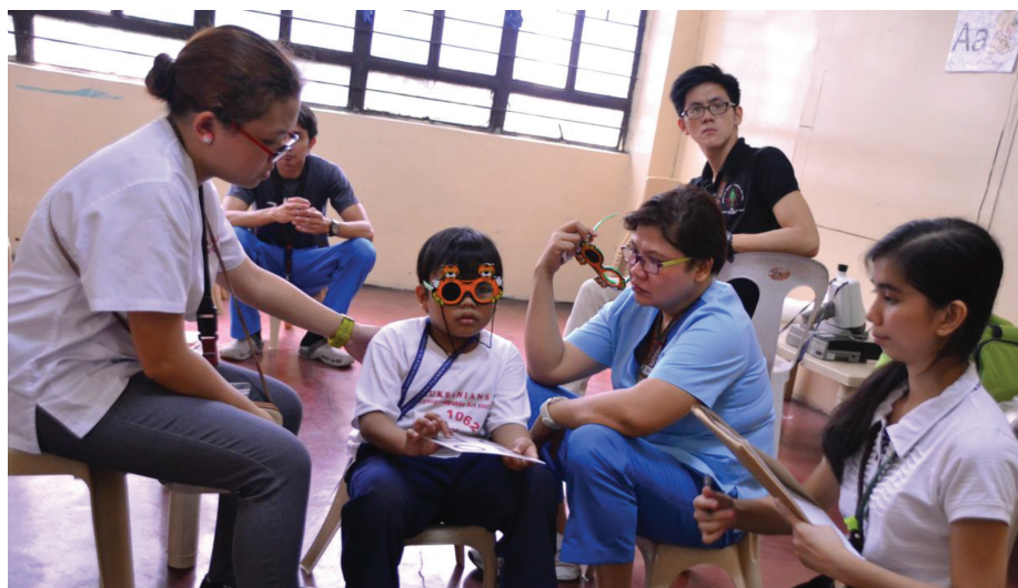
Pilot testing at Justo Lukban Elementary School, in November 2013