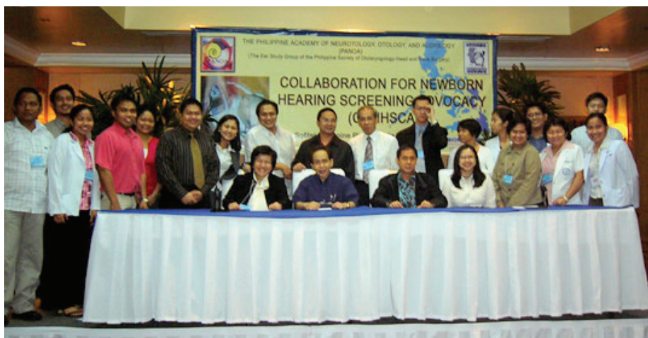
The first Collaboration on Newborn Hearing Screening Advocacy meeting that ratified the Universal Newborn Hearing Screening position statement presented to Senator Loren Legarda was held in 2007.

A year later, in August 2009, President Gloria Macapagal-Arroyo signed it into law. Probably, one of the fastest health bills ever passed. "After the bill was passed, it had to take another year before