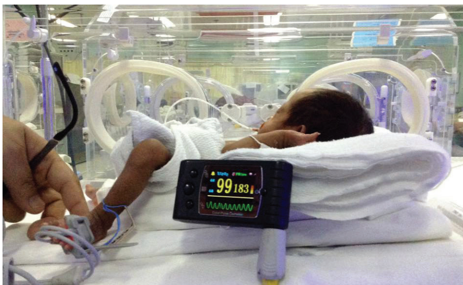
The pulse oximeter shows the oxygen level in the blood of the newborn

(Tetralogy of Fallot, D-Transposition of the Great Arteries, Double Outlet Right Ventricle, Truncus Arteriosus), Total Anomalous Pulmonary Venous Return (TAPVR), Ebstein Anomaly, right obstructive defects (Tricuspid atresia, Pulmonary Valve Atresia-Intact Ventricular septum, Critical Pulmonary Stenosis), and left obstructive defects (Hypoplastic Left Heart Syndrome, Coarctation of the Aorta, Aortic arch atresia or hypoplasia, Critical Aortic valve stenosis). As mentioned, without timely and appropriate intervention, these may lead to the demise of the newborn.