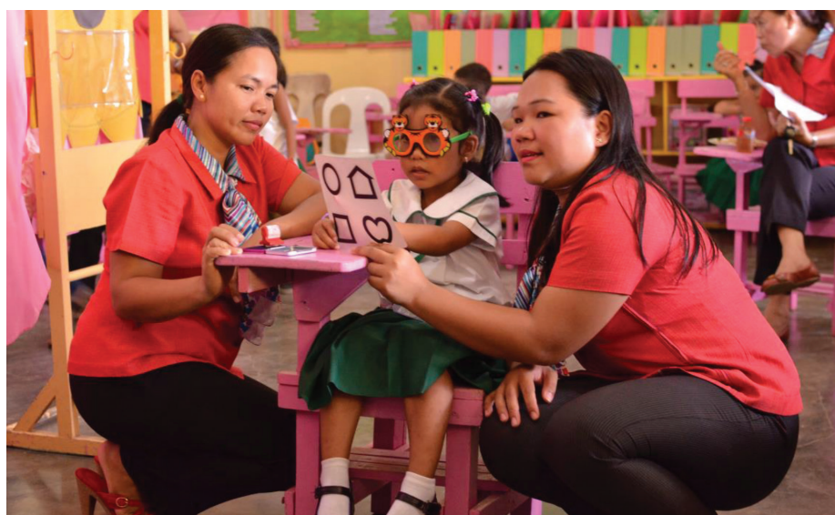
Teachers at the Cecilio Apostol Elementary School screens kindergarten pupils for possible amblyopia and refraction errors.

Out of 863 pupils screened from 19 pilot schools, 713 (83%) passed the screening while 150 (17%) failed. From those who failed, 75% were diagnosed with errors of refraction while 25% were found to have amblyopia. As an immediate intervention, students who failed in the test will be asked to sit in the front