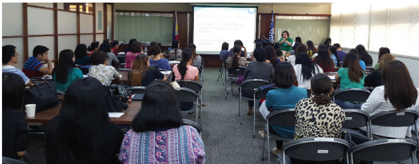
A group of Newborn Hearing Screening personnel attending the certifying course.

Dr. Jose Rizal's words resound in the pages of history that the youth is the hope of this nation; hence, the Filipino children's right to healthy development must always be championed.