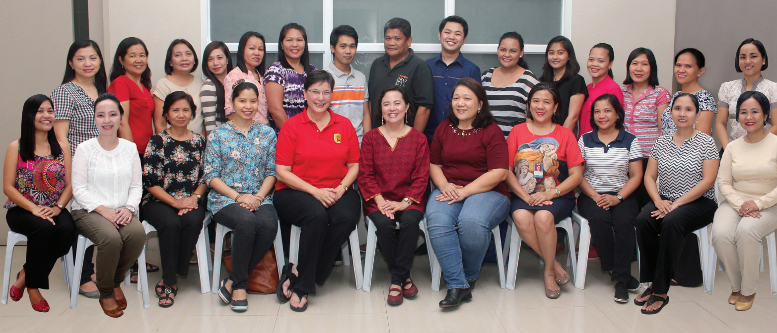
The PGH-CPU Multidisciplinary Training Team

In 1999, child abuse was integrated in the curriculum of all medical school members of the Association of Philippine Medical Colleges (APMC). In that same year, PGH-CPU started training WCPU teams in child protection.