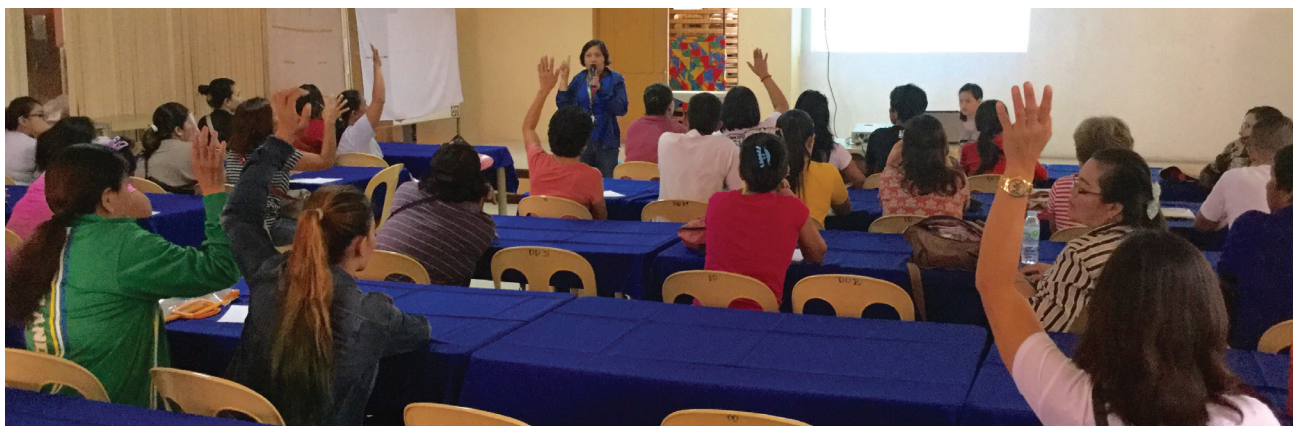
Parenting classes conducted in PGH-CPU

their roles in supporting the child-witness, address court trial-related concerns, and empower children during the pre-court, actual and post-court experience.