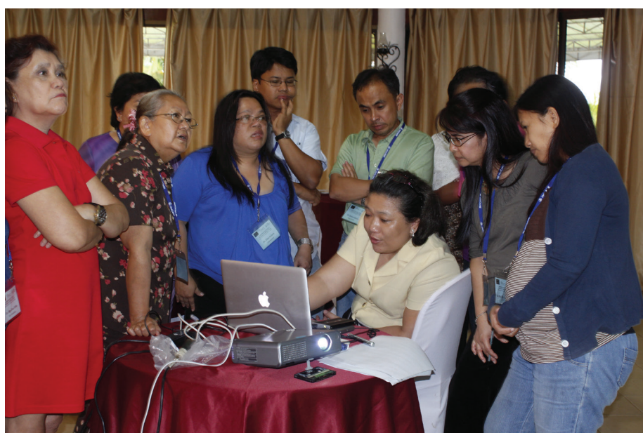
Multidisciplinary training in Baguio, Bukidnon participants (Photo courtesy of Child Protection Network Foundation).

Several issues affecting WCPU program implementation were noted in the study. These